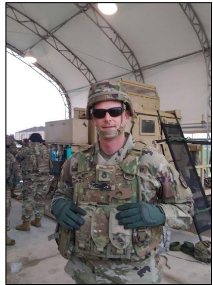
Waiting to be “rolled” in the MRAP