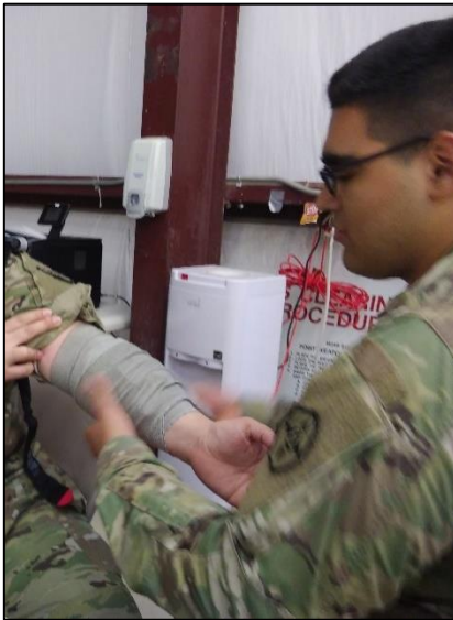
First Aid Training