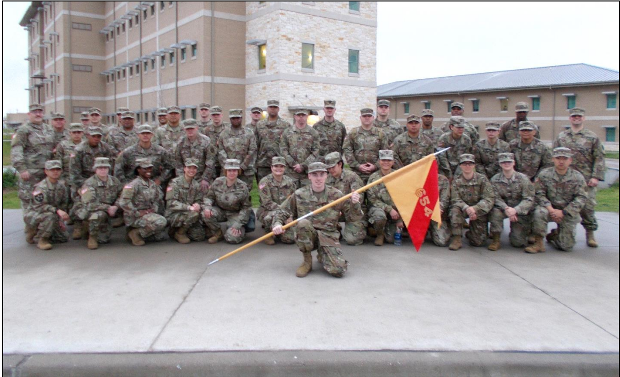
HHC Forward, Detachment 3, 654 th RSG on 14 March 2020 at North Fort Hood, Texas.

spent three days visiting the Fort Hood Range Operations Office and observing both the firing desk and range control inspection staff in action.