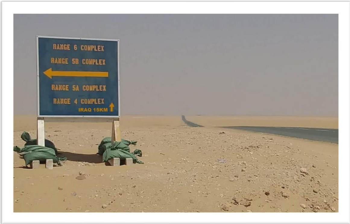
We almost made it to the place where you don't want to go.