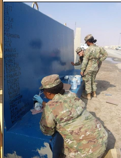
T-Wall Artists at work (SPC Lowman & Harris)