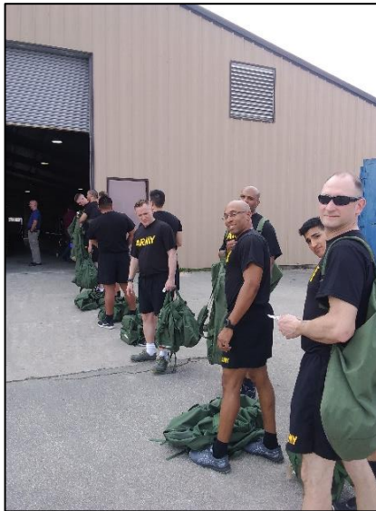
OCP and Tactical Gear Issue